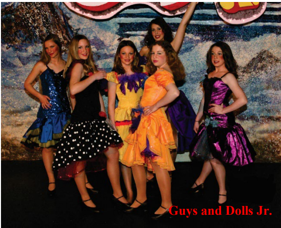
Guys and Dolls Jr.

The founders and those who support “ New Artists Productions ” volunteer their time to encourage young people to enjoy the theater experience. Sponsors assist in the funding of the program which affords us the opportunities to offer the program at no cost to the participants.