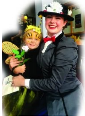
Disney’s, Mary Poppins Jr.

Those who have the providence to nurture and encourage these children are blessed with the opportunity to help mold their character. Those involved with “New Artists Productions” are especially aware of this opportunity and their responsibility. The recognition of this premise is the hallmark of their relationship with all children who pass through their program.